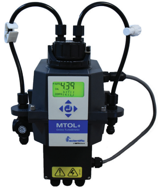
MTOL+ Online Process Turbidimeter Factory default 0 - 100 NTU