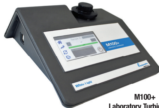
M100+ Laboratory Turbidimeter

*ProCal NTU Standards are EPA approved for use as primary NTU standards